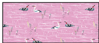
FABRIC A DC8353-Pink 2 1/8 yards