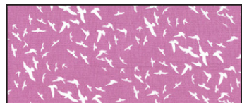
FABRIC E DC8355-Rose 1/2 yard