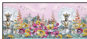
FABRIC D DC8351-Blossom 2 1/2 yards