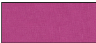
FABRIC B SC5333-Orchid 1 1/2 yards